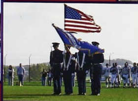
The Color Guard, honors our country.